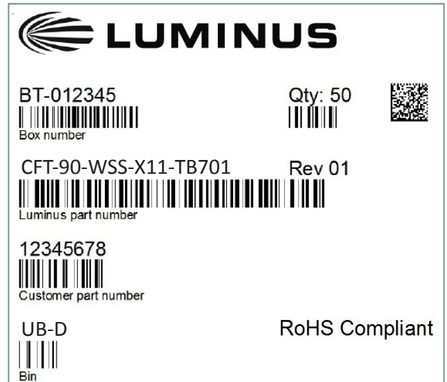
Sample label –for illustration only