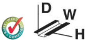
Figure shows PLC-BSC-120UC/21-21/SO46 version

14 mm PLC basic terminal block for high continuous currents with screw connection, without relay or solid-state relay, for mounting on DIN rail NS 35/7,5, 1 PDT, input voltage 60 V DC