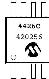
8-Lead PDIP (300 mil)