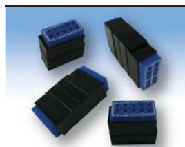
Feedback Modules Feedthru Modules

QPL-approved MIL-T-81714 modules and MIL-C-39029/1 contacts are available in four standard sizes accommodating 12-26 AWG wires in both feedback and feedthru types with full a selection of bussing arrangements. The complete MIL-T-81714 Series I Terminal Junction System includes the following products.