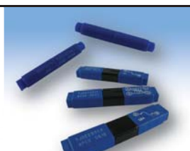
Single In-Line Splices Dual In-Line Splices Electronic Splices