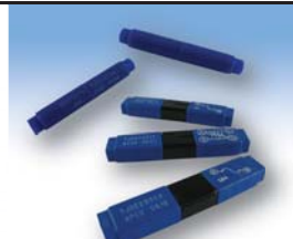
Single In-Line Splices Dual In-Line Splices Electronic Splices