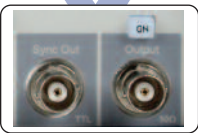
4033 Output Section – Main output and Sync output