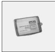
C. Soft Plastic Case