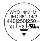
WYO 3.3 nF to 12 nF

All approval marks are also shown on the label.