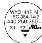
WYO 3.3 nF to 12 nF

All approval marks are also shown on the label.