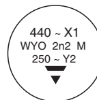
WYO 1 nF to 2.5 nF