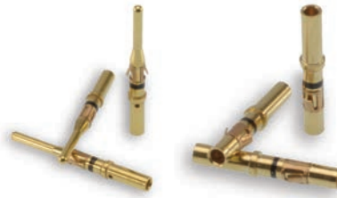
Size 16 AWG, No Insulation Grip