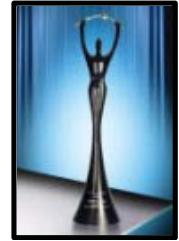
Electra Award 2005