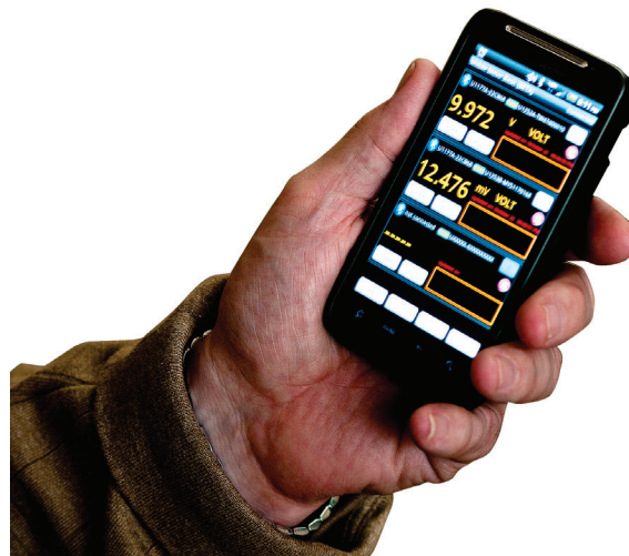
Figure 6. Make measurements with the Keysight Mobile Meter via an Android smart phone

Keysight Mobile Meter is a free Android application software that allows an Android device to connect, control and perform up to 3 multimeter measurements. Without the need to be physically present at various points, users can now extend their reach to two or three places. This solution allows you to make measurements from a safe distance, eliminates the need to walk back-and-forth between measure target and control points, and monitors multiple measurements simultaneously. Achieve higher work productivity when you use the U1177A with your Keysight handheld digital multimeters.