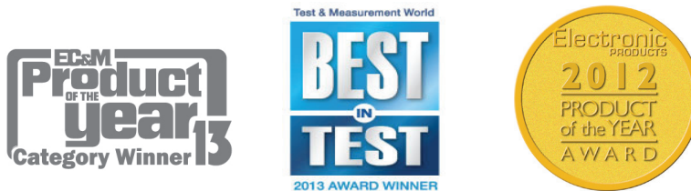
Figure 1. Award winning U1177A Infrared (IR)-to- Bluetooth adapter is being recognized as an innovative solution in Test & Measurement industry

Keysight Technologies, Inc. U1177A Infrared (IR)-to- Bluetooth adapter offers wireless remote connectivity solution via Bluetooth connection simply by attaching the adapter to the IR port of a Keysight handheld digital multimeter. The wireless remote connectivity is set up when a Keysight handheld digital multimeter is connected to U1177A and an Android device (tablet or smart phone) with the installed software. Every U1177A also has a unique Media Access Control (MAC) address. User can quickly and easily scan for the right U1177A using their Android device and pair up with the U1177A.