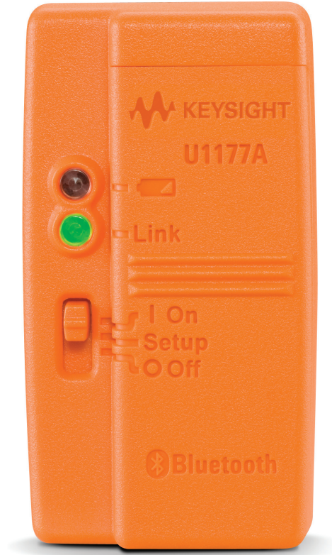
Figure 3. The U1177A as illustrated