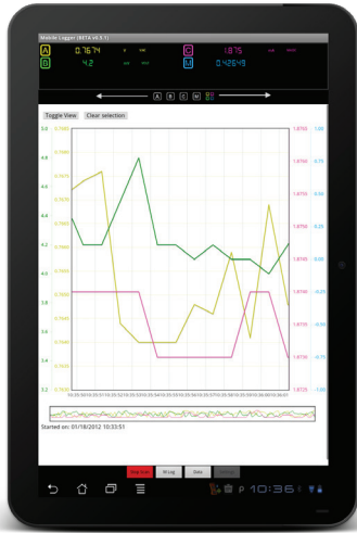
Figure 4. Data logging with Keysight Mobile Logger software.

Data logging is an important function for industrial users to capture data streams or plotting trending graphs. These data and graphs are used for analysis to identify intermittent behavior or detect drifts. Keysight Mobile Logger is the free Android application software that logs data and provides trending graphs from Keysight handheld digital multimeters. Keysight Mobile Logger offers an array of extended functions such as sending e-mail or Short Message Service (SMS) automatically, and pan and zoom function via the Android device's touch screen. Alternatively, data logging and monitoring activities can also be performed at the comfort of one's Personal Computer (PC) via a downloadable Keysight GUI data logger software.