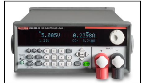
Model 2380-500-15 front view showing the safety covers on the input terminals.