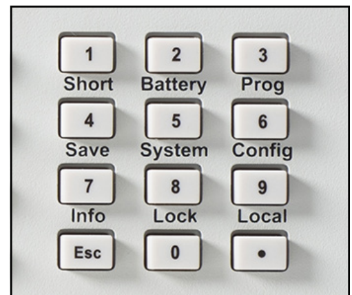
Figure 1. Use either the rotary knob or the keypad to quickly enter settings and set parameter values using all the available resolution.