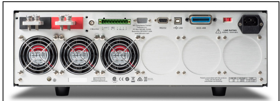
Model 2380-500-30 rear panel