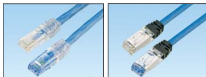
Keyed UTP Copper Patch Cords