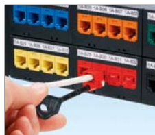
PSL-DCPLX, PSL-DCPLRX, and PSL-DCPLS