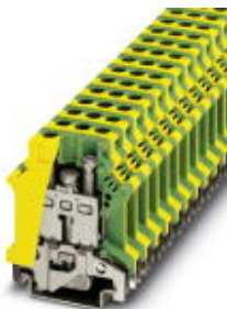
Ground modular terminal block, Connection method: Screw connection, Cross section: 0.5 mm 2 - 16 mm 2 , AWG 20 - 6, Width: 10.2 mm, Color: green-yellow, Mounting type: NS 35/7.5, NS 35/15, NS 32

Please be informed that the data shown in this PDF Document is generated from our Online Catalog. Please find the complete data in the user's documentation. Our General Terms of Use for Downloads are valid ( http://download.phoenixcontact.com )