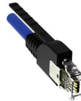
With Pull Tab PNs 2100356/357 PNs 2142758/759