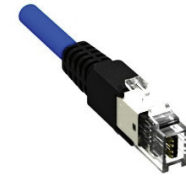
Without Pull Tab PNs 2159683/684