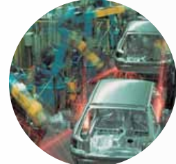
Vehicle manufacturing equipment