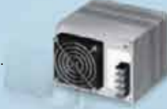
Standard Power Supply with Fan

Fan replacement every 2 to 3 years Dust drawn in by fan