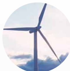
Wind power generation