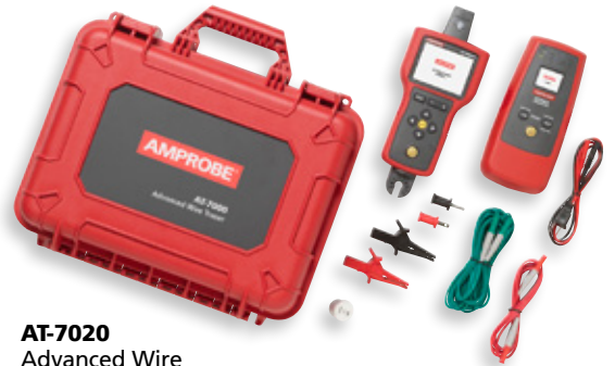
AT-7020 Advanced Wire Tracer Kit