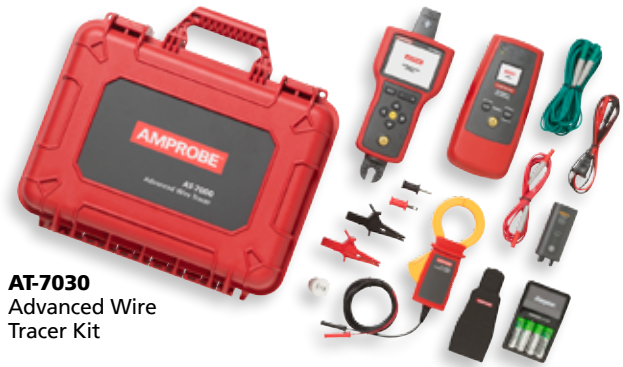
AT-7030 Advanced Wire Tracer Kit