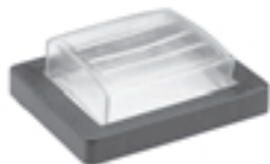
TRANSPARENT SILICONE BOOT U2150