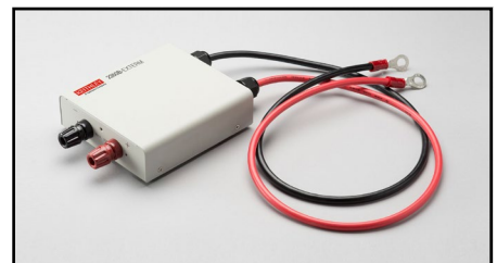
Model 2260B-EXTERM: Extended terminal; Test Leads, 0.7m (28 in.), and terminal box to bring outputs to the front of the instrument or another location. Magnetic base attaches to side of instrument.