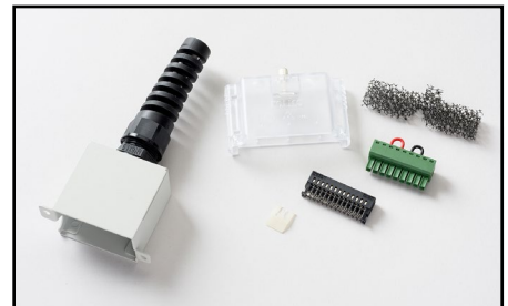
Model 2260-010: Basic Accessories Kit (250V and 800V models): Air filter, analog protection cover, analog control lock lever, output terminal cover, output terminal connector, strain relief.