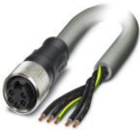
Power cable, 5-pos., gray PVC, 2.5 mm 2 , free cable end to straight 7/8" 16UNF socket, length: 10.0 m

Please be informed that the data shown in this PDF Document is generated from our Online Catalog. Please find the complete data in the user's documentation. Our General Terms of Use for Downloads are valid ( http://download.phoenixcontact.com )