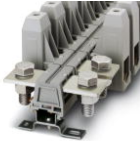
Universal terminal block with bolt connection, cross section: 70 - 240 mm 2 , width: 53 mm, color: gray

Please be informed that the data shown in this PDF Document is generated from our Online Catalog. Please find the complete data in the user's documentation. Our General Terms of Use for Downloads are valid ( http://download.phoenixcontact.com )