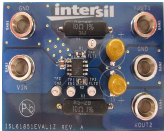
FIGURE 32B. ISL61851EVAL1Z BOARD PHOTO