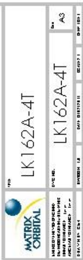
Figure 14: LK162A-4T Dimensional Drawing