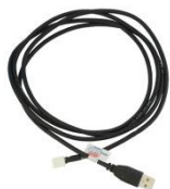
Figure 5: Four Pin USB Cable (CBL-USBA24PIN3FT)

The Four Pin USB cable is recommended for the LK162A-4T-USB display. It will connect to the keyed, friction lock style header on the unit and provide a connection to a regular A style USB connector, commonly found on a PC.