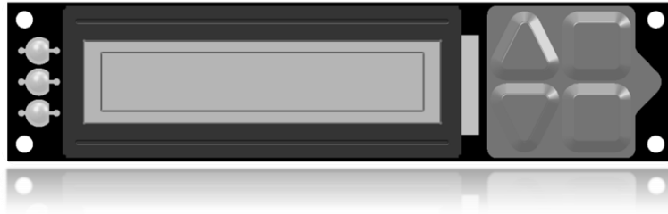
Figure 1: LK162A-4T Display

The LK162A-4T is an intelligent alphanumeric liquid crystal display designed to decrease development time by providing an instant solution to any project. In addition to the RS232, TTL and I2C protocols available in the standard model, the USB communication model allows the LK162A-4T to be connected to a wide variety of host controllers. Communication speeds of up to 115.2kbps for serial protocols and 100kbps for I 2 C ensure lightning fast display updates.