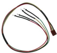
Figure 4: Breadboard Cable (BBC)

The most common cable choice for any alphanumeric Matrix Orbital Display, the Communication/ Power Cable offers a simple connection to the unit with familiar interfaces. DB9 and floppy power headers provide all necessary input to drive your display.