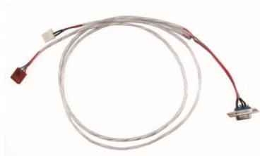
Figure 3: Communication/Power Cable (SCCPC5V)

The most common cable choice for any alphanumeric Matrix Orbital Display, the Communication/ Power Cable offers a simple connection to the unit with familiar interfaces. DB9 and floppy power headers provide all necessary input to drive your display.