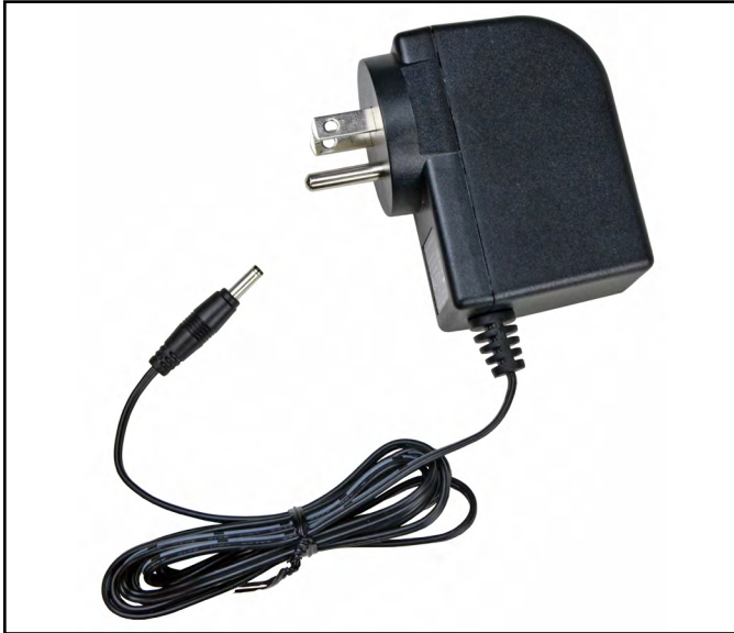
Figure 2. North American power adapter included with the 19239 and 19242 Mini Monitors