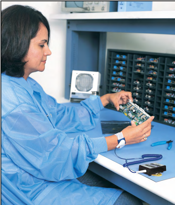
Figure 8. Using the Mini Monitor