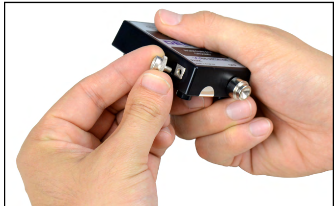
Figure 7. Changing the park snap on the 19243 Mini Monitor

The 19243 Mini Monitor includes an interchangeable 10mm park snap and 10mm banana jack adapter for operators who use wrist cords with 10mm terminations. Use the park snaps' knurled rims to unscrew the 4mm park snap from the monitor and install the 10mm park snap to the monitor. Plug the 10mm operator jack adapter into the monitor's operator jack.