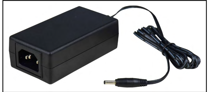
Figure 3. Universal power adapter included with the 19243 Mini Monitor

NOTE: The power cord must be purchased separately if ordering the 19243 Mini Monitor. The power cords are available as the following item numbers: