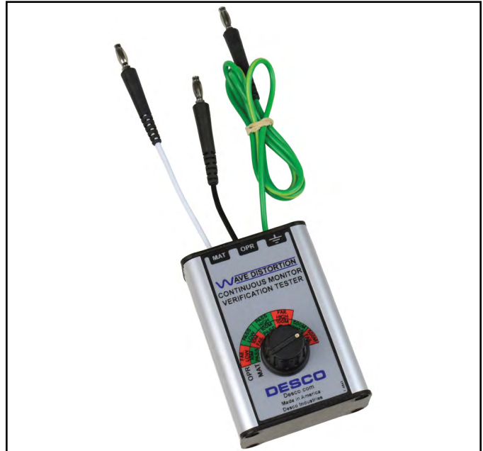
Figure 9. Desco 98221 Wave Distortion Monitor Verification Tester