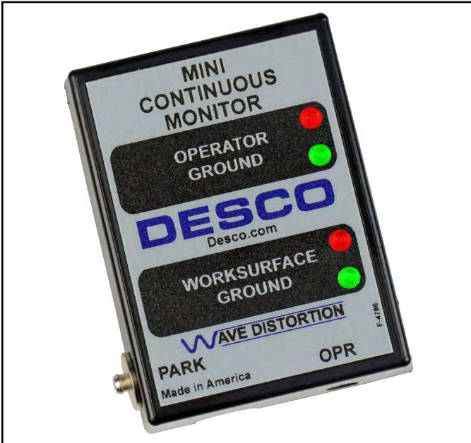
Figure 1. Desco Mini Monitor