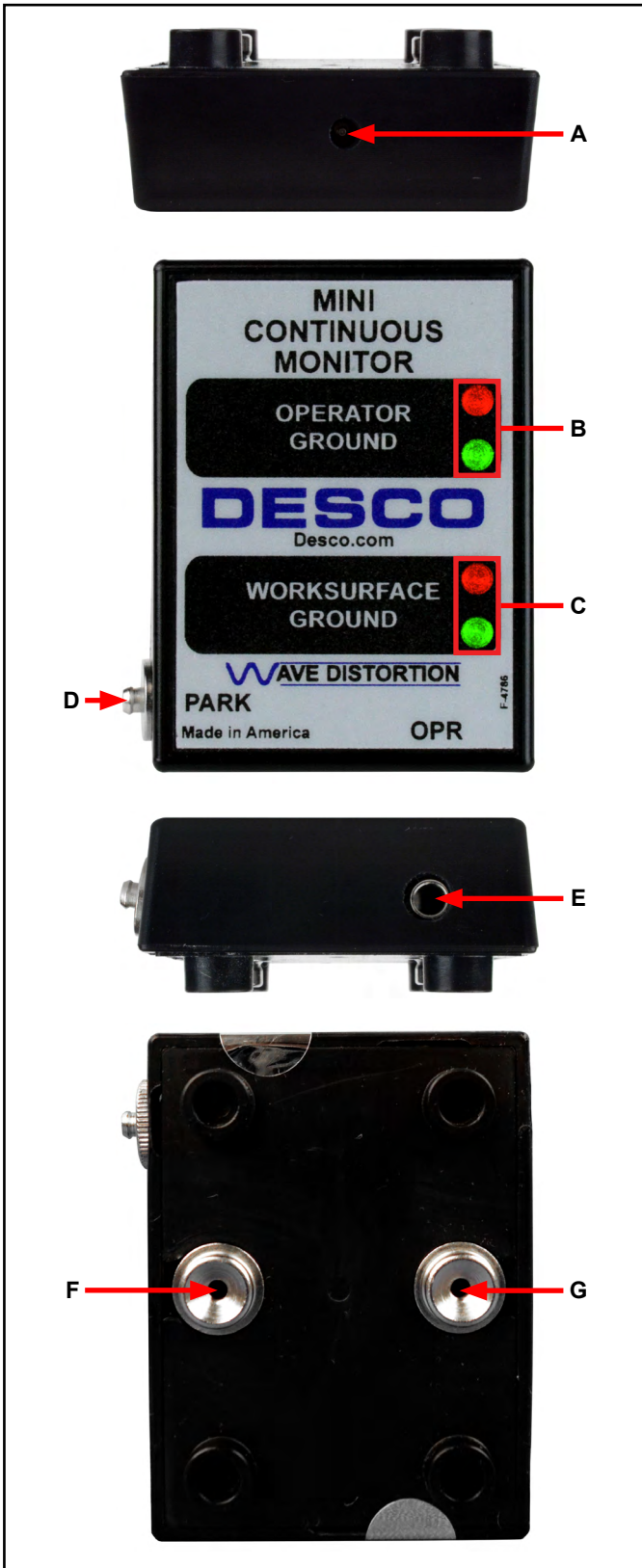
Figure 4. Mini Monitor features and components

A. Power Jack: Connect the included 24VDC power adapter here.