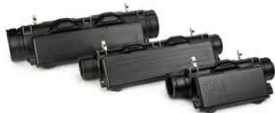
3M™ SLiC™ Terminals 319, 328, 530