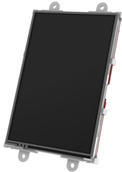
The uLCD-35DT Display Module

NOTE (*): Arduino remains the property of the Arduino Team. All references to the word Arduino and Arduino Hardware are licensed under the Creative Commons Attribution Share-Alike license.