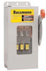
CF_ Quik-Spec™ Safety Switch disconnect (optional window). Data Sheet 1156

The only controlled copy of this Data Sheet is the electronic read-only version located on the Cooper Bussmann Network Drive. All other copies of this document are by definition uncontrolled. This bulletin is intended to clearly present comprehensive product data and provide technical information that will help the end user with design applications. Cooper Bussmann reserves the right, without notice, to change design or construction of any products and to discontinue or limit distribution of any products. Cooper Bussmann also reserves the right to change or update, without notice, any technical information contained in this bulletin. Once a product has been selected, it should be tested by the user in all possible applications.