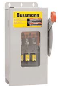
CF_ Quik-Spec™ Safety Switch disconnect (optional window). Data Sheet 1156

The only controlled copy of this Data Sheet is the electronic read-only version located on the Cooper Bussmann Network Drive. All other copies of this document are by definition uncontrolled. This bulletin is intended to clearly present comprehensive product data and provide technical information that will help the end user with design applications. Cooper Bussmann reserves the right, without notice, to change design or construction of any products and to discontinue or limit distribution of any products. Cooper Bussmann also reserves the right to change or update, without notice, any technical information contained in this bulletin. Once a product has been selected, it should be tested by the user in all possible applications.