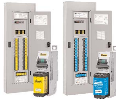
CCPB 1-, 2- & 3-Pole disconnects for the Quik-Spec™ Coordination Panelboard. Data Sheet 1160