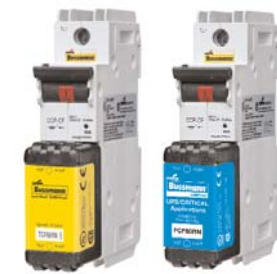
CCP_CF 1-, 2- & 3-Pole switched disconnects Data Sheet 1157