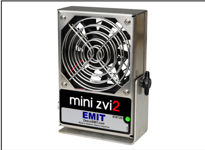
Figure 1. EMIT 50642 Mini Zero Volt Ionizer 2