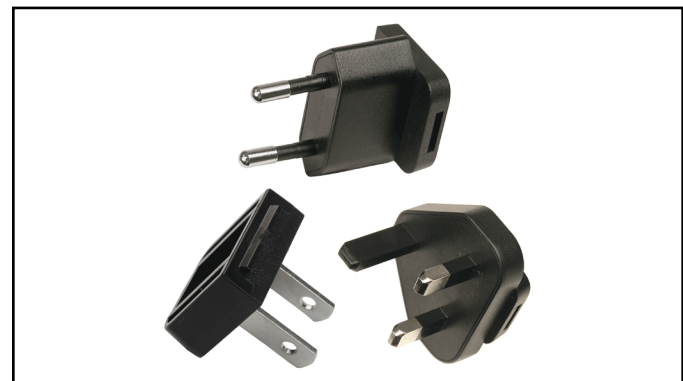
Figure 2. Interchangeable power adapter plugs included with the Mini Zero Volt Ionizer 2