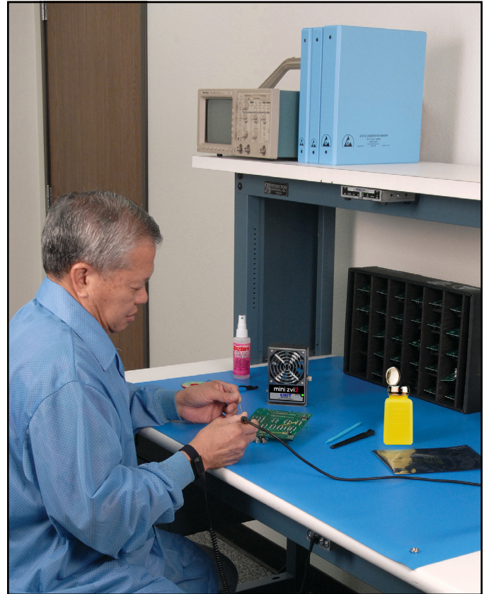
Figure 4. Using the Mini Zero Volt Ionizer 2 at a workstation.