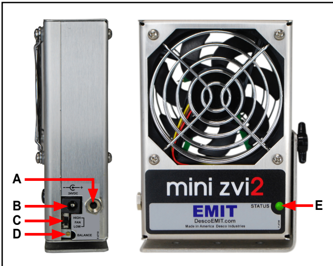
Figure 3. Mini Zero Volt Ionizer 2 features and components

A. Ground Jack: Insert the banana plug end of the included ground cord to this jack. Connect the ring terminal end of the cord to equipment ground.