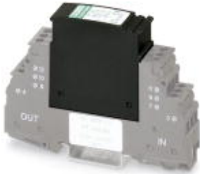
PT protective connector with protective circuit for a 2-wire floating signal circuit. HART-compatible.

Please be informed that the data shown in this PDF Document is generated from our Online Catalog. Please find the complete data in the user's documentation. Our General Terms of Use for Downloads are valid ( http://download.phoenixcontact.com )