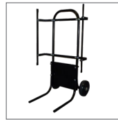
AC6000-MNT-00 Mounting Frame Optional for mounting ISB to a cart or other surface. Included with the AC6000-CART-00.