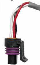
Mating Connector 2