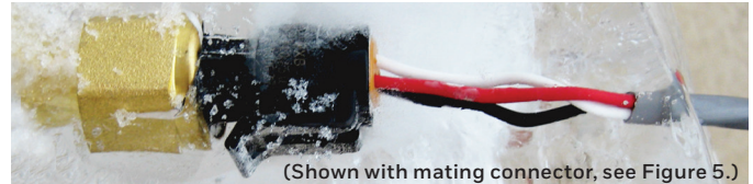
Figure 2. PX3 Series External Freeze/Thaw Resistance