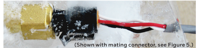
Figure 2. PX3 Series External Freeze/Thaw Resistance