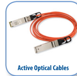
Active Optical Cables