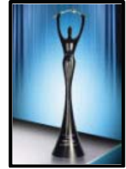
Electra Award 2005