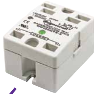
Blade Terminals DPST-NO