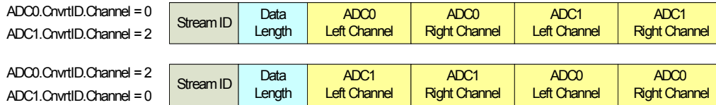
Figure 1. Multi-channel capture

The following figure describes the bus waveform for a 24-bit, 48KHz capture stream with ID set to 1.