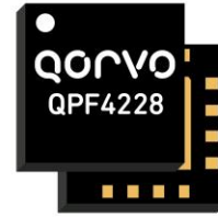
16 Pin 3x3 mm Laminate Package

The QPF4228 integrates a 2.4GHz power amplifier (PA), regulator, single pole three throw switch (SP3T), low noise amplifier (LNA) and coupler into a single device