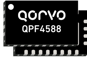
24 Pin 5x3 mm QFN Package

The QPF4588 integrates a 5 GHz power amplifier (PA), regulator, single pole two throw switch (SP2T), bypassable low noise amplifier (LNA) and coupler into a single device