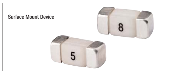
Surface Mount Device