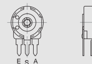
(D48, rotor shown at final position)

Power Rating: 24V / 15mA ON position resistance: ≤ 5 Ω Insulation Resistance: ≥ 30 MΩ