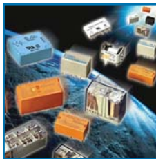
Schrack PCB Relays