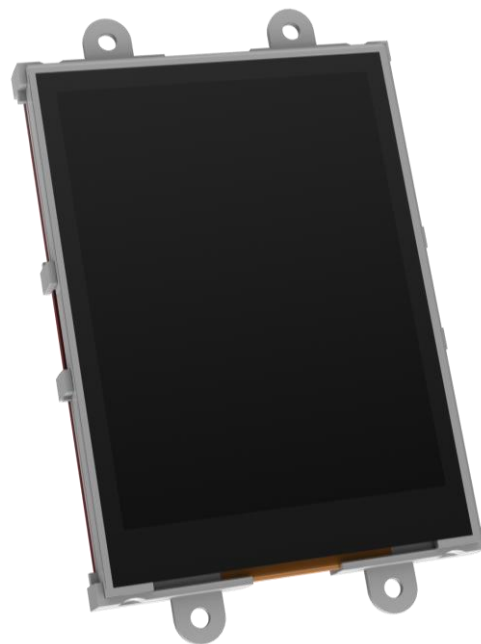
The uLCD-28-PTU Display Module