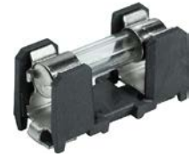
OGN-SMD equipped with fuse

500 VAC · 4 W/16 A (VDE) · 500 V · 16 A (UL/CSA)