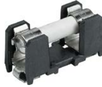
OGN-SMD equipped with fuse