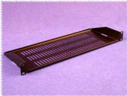
Vented (7" Deep - 1U Shown)

Path: Home > Rack Index > Shelves (Fixed) - Panel Mount