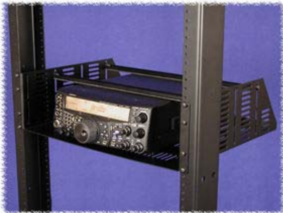
Example of clamped equipment (in this case 10.5" wide)