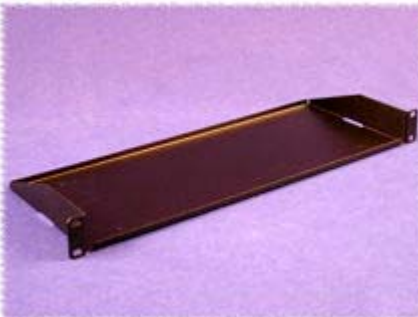
Unvented (7" Deep - 1U Shown)